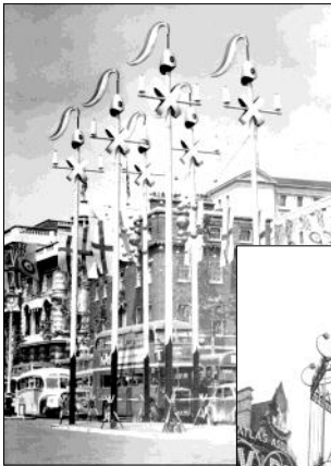
↑ Decorations in Whitehall