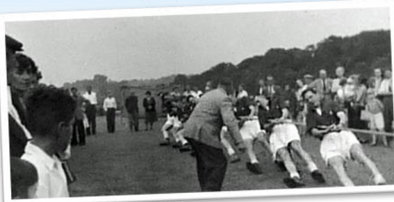
Warwickshire Constabulary wins the Tug-of-War, 1955