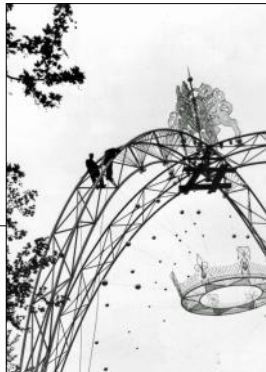
← Decorations in The Mall, with workmen visible