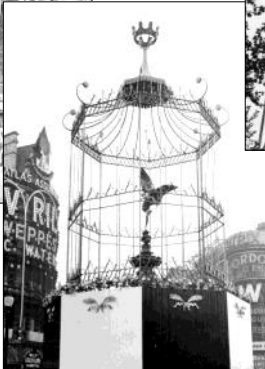
→ Eros, caged